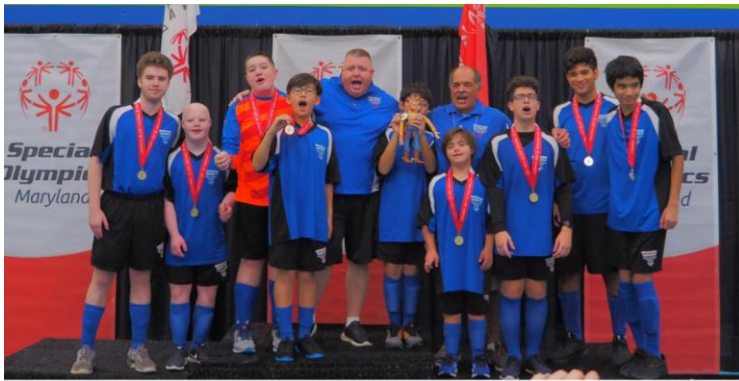
SOHO Soccer Player Development Team who received their Challenge Medals at State Games..